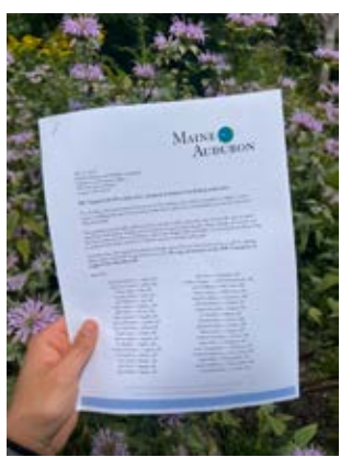
Maine Audubon advocated for the Common Loon at the State House and delivered an impressive petition in support of LD 958.