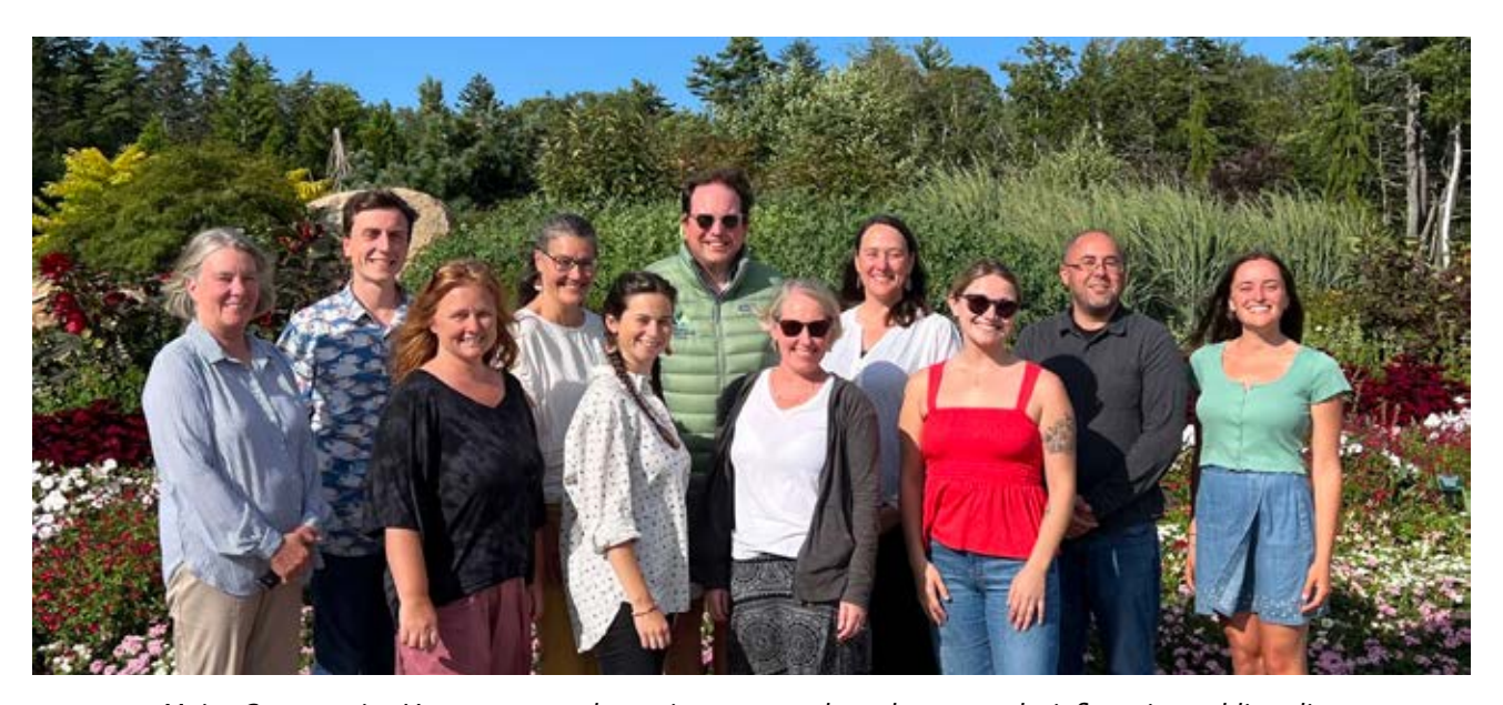
Maine Conservation Voters protects the environment and our democracy by influencing public policy, holding politicians accountable, and winning elections.