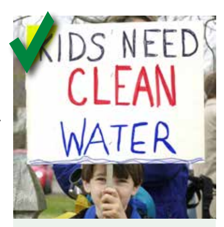
FINAL OUTCOME: Bill vetoed by governor; veto override successful.