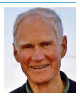
Sen. Brownie Carson

also pushed for a strong bill, which was approved 12-1 by the committee. The committee chairs expertly guided the committee through deliberation on the seven different mining bills that were introduced.