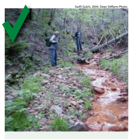
FINAL OUTCOME: Bill vetoed by governor; veto override successful.