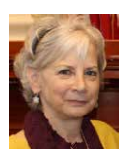
Sen. Jay McCreight

Rep. McCreight introduced a bill to establish a program of storage, collection, and disposal of expired marine flares (LD 252). Marine flares are explosive and contain toxic chemicals harmful to marine life. People often do not know how to safely dispose of them and few options exist. The common-sense bill received a 12-1 'Ought to Pass' recommendation from the Criminal Justice and Public Safety Committee. The bill was enacted unanimously in the Senate and by a vote of 85-58 in the House. The governor vetoed the bill and the veto was sustained in the House by a vote of 84-62.