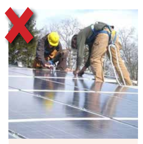
FINAL OUTCOME: Bill vetoed by governor; veto sustained.