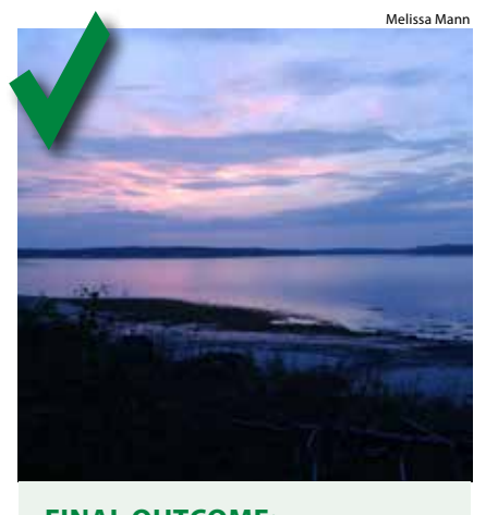
FINAL OUTCOME: Bill vetoed by governor; veto override successful.