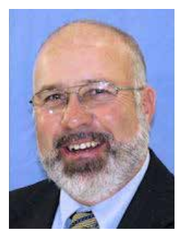
Rep. Russell Black

Agriculture, Conservation and Forestry Committee (ACF) chairs Sen. Davis and Rep. Dunphy , along with Sen. Saviello , worked diligently on LD 586. The ACF committee voted unanimously to approve the bill. Reps. Black and Skolfield worked to persuade the House Republican caucus to support the bill despite the governor's opposition. While the House voted to enact the bill 136-8, the override vote was 97-40: twenty-nine Republican House members first voted in support of the bill but flipped their votes to sustain the governor's veto. Rep. Timberlake worked with the governor's staff to try to defeat the bill.