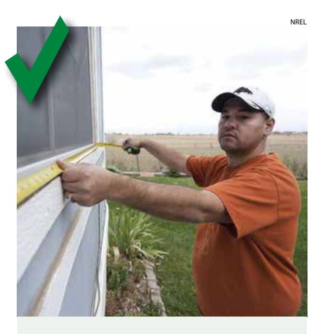
FINAL OUTCOME: Bill defeated.