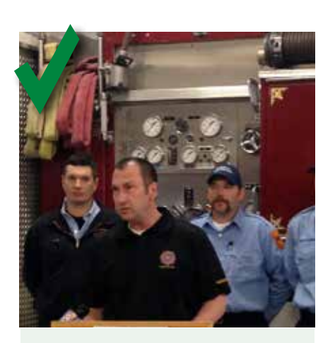
FINAL OUTCOME: Bill vetoed by governor; veto override successful.