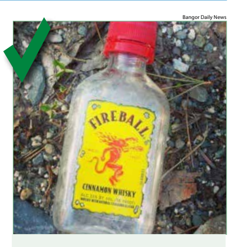
FINAL OUTCOME: Bill vetoed by governor; veto override successful.