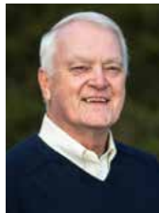
Rep. Norman Higgins (R-Dover-Foxcroft)