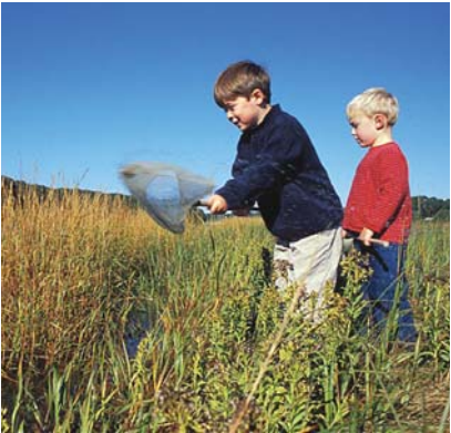
TRUST FOR PUBLIC LAND