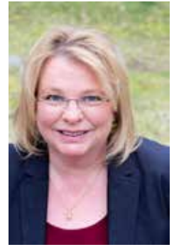
Rep. Lydia Blume

Rep. Blume sponsored a bill (LD 540) that would have encouraged municipalities to develop policies and plan for the effects of rising sea level on buildings, transportation infrastructure, and sewage treatment facilities. This common-sense bill was approved unanimously by the State and Local Committee and passed the House and the Senate. It was vetoed by the governor and the veto override failed. Reps. Bickford and Ordway voted for the bill but once the governor vetoed it, they flipped to sustain the veto. Republican Reps. Corey, Foley, Gillway, Hanington, Harrington, Pickett, and Vachon held strong and supported the bill on each vote.