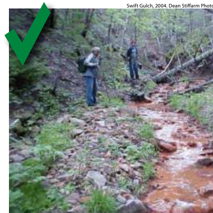
Swift Gulch, 2004.

FINAL OUTCOME: Bill vetoed by governor; veto override successful.