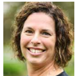
Rep. Michelle Dunphy

Agriculture, Conservation and Forestry Committee (ACF) chairs Sen. Davis and Rep. Dunphy , along with Sen. Saviello , worked diligently on LD 586. The ACF committee voted unanimously to approve the bill. Reps. Black and Skolfield worked to persuade the House Republican caucus to support the bill despite the governor's opposition. While the House voted to enact the bill 136-8, the override vote was 97-40: twenty-nine Republican House members first voted in support of the bill but flipped their votes to sustain the governor's veto. Rep. Timberlake worked with the governor's staff to try to defeat the bill.