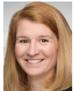
Rep. Heather Sanborn

Rep. Sanborn introduced a bill (LD 1313) to increase funding to residential energy efficiency programs through the Regional Greenhouse Gas Initiative (RGGI). RGGI has successfully reduced pollution, strengthened our economy, and reduced energy costs since 2009. Because RGGI revenues were lower than predicted, a significant portion of the funding ended up going to industrial users and less to residential programs. The bill was amended so that residential programs would remain adequately funded and payments to industrial users would be delayed. The bill passed the legislature and was signed into law by the governor.