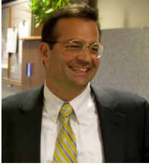
Rep. Seth Berry

Bill sponsor Sen. Saviello worked enthusiastically to get this bill passed. On the Energy, Utilities, and Technology (EUT) Committee, chairs Sen. Woodsome and Rep. Berry made every effort to fashion a bill that a significant majority of the committee would support. The committee vote was 8-5 in support of the bill and the House vote passed 90-54. A week later, Reps. Harvell and Wadsworth offered an amendment, described on page 8, on the House floor. The amended bill received votes of 105-41 in the House and 29-6 in the Senate, The governor subsequently vetoed the bill.