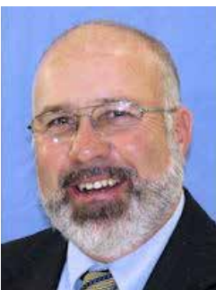
Rep. Russell Black

Agriculture, Conservation and Forestry Committee (ACF) chairs Sen. Davis and Rep. Dunphy , along with Sen. Saviello , worked diligently on LD 586. The ACF committee voted unanimously to approve the bill. Reps. Black and Skolfield worked to persuade the House Republican caucus to support the bill despite the governor's opposition. While the House voted to enact the bill 136-8, the override vote was 97-40: twenty-nine Republican House members first voted in support of the bill but flipped their votes to sustain the governor's veto. Rep. Timberlake worked with the governor's staff to try to defeat the bill.