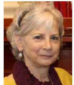
Sen. Jay McCreight

Rep. McCreight introduced a bill to establish a program of storage, collection, and disposal of expired marine flares (LD 252). Marine flares are explosive and contain toxic chemicals harmful to marine life. People often do not know how to safely dispose of them and few options exist. The common-sense bill received a 12-1 'Ought to Pass' recommendation from the Criminal Justice and Public Safety Committee. The bill was enacted unanimously in the Senate and by a vote of 85-58 in the House. The governor vetoed the bill and the veto was sustained in the House by a vote of 84-62.